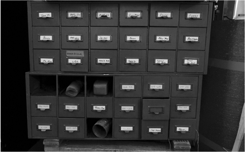
A storage space in Powell Hall for many of the orchestra's unique instruments.

New compositions often come filled to the brim with odd sounds, new instruments, and unconventional techniques. To capture a certain wildness, Lotta Wennäkoski's Flounce pushes the SLSO's musicians to the edge.