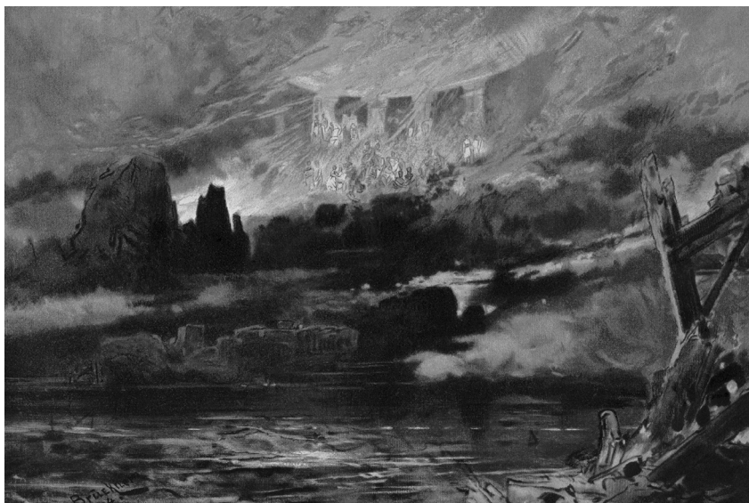
The Twilight of the Gods: Conclusion. Set design, 1894.