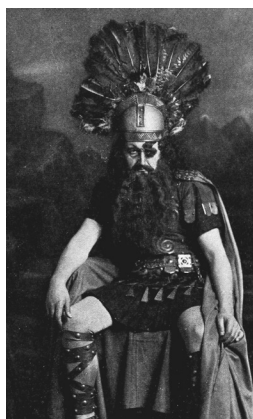
Wotan (Clarence Whitehall, bass baritone, 1912).

Performance Time approximately 45 minutes