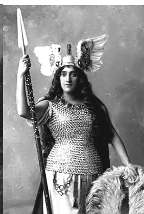
Brünnhilde (Anna Bahr-Mildeburg, soprano).