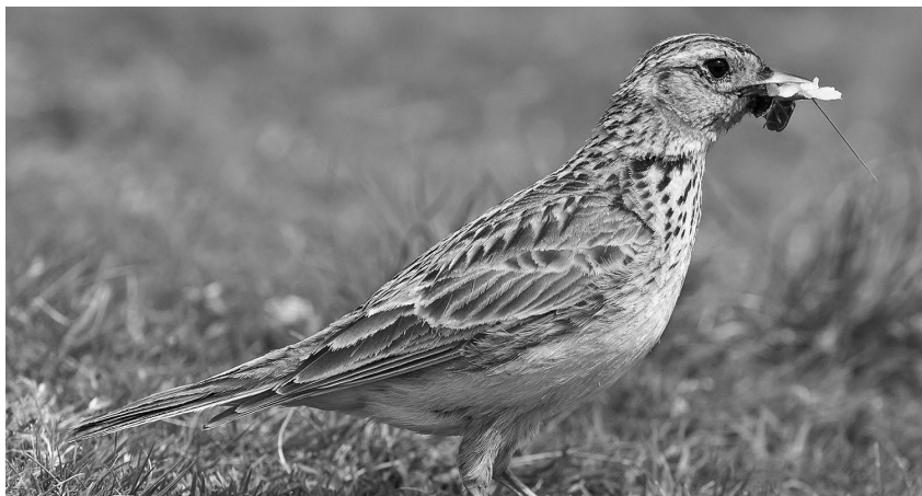
A skylark, with insects in its beak, in the Lake District, England.

Shrill, irreflective, unrestrain'd, Rapt, ringing, on the jet sustain'd Without a break, without a fall, Sweet-silvery, sheer lyrical.