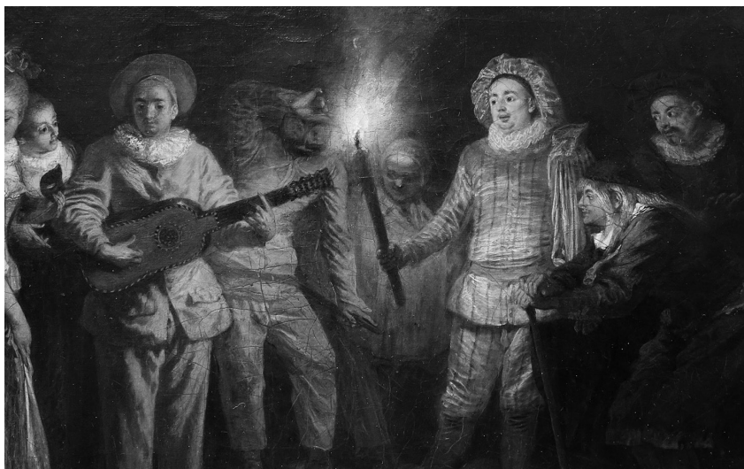
Serenata: An Italian Serenata by Antoine Watteau (1715).

On another path, the “serenade” became late-night pieces of outdoor entertainment at parties. Thousands of such works were written, at first for wind instruments (with their greater volume), and later for string ensembles.