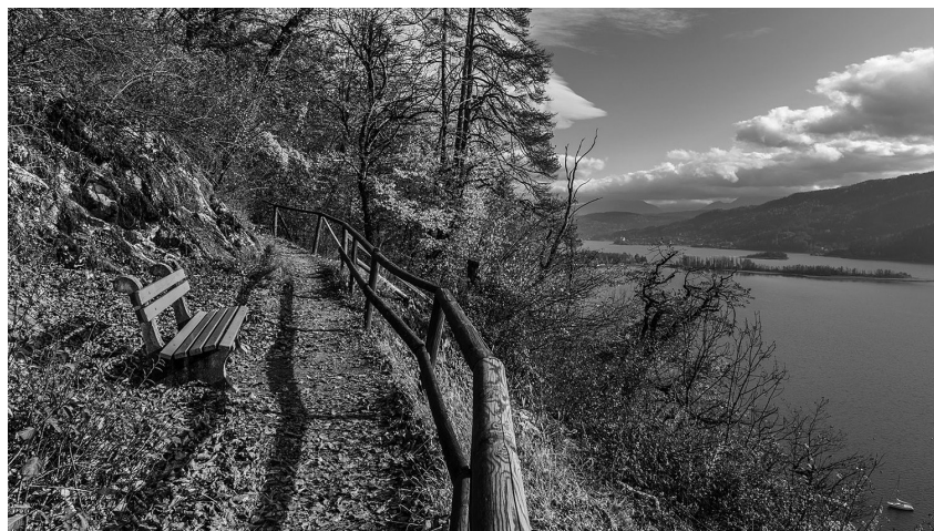
Portschach am Wörthersee, where Brahms began work on the Second Symphony.

Performance Time approximately 43 minutes