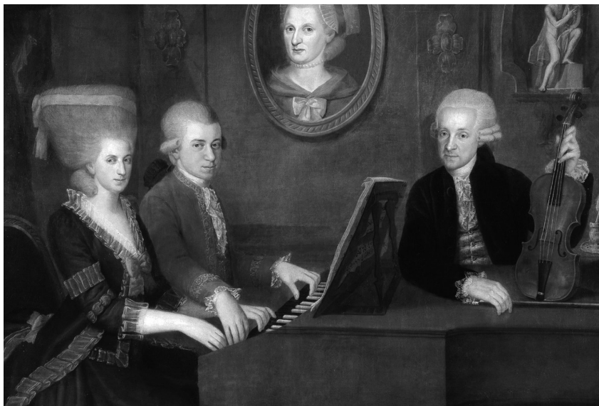
The Mozarts: Wolfgang Amadeus, Maria Anna (his sister), and Leopold. Portrait by Johann Nepomuk della Croce.

long ears,” he wrote. Wolfgang listened: the concerto Leopold heard that day in the Burgtheater welcomed all listeners.