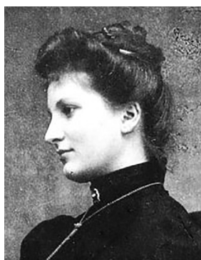
Alma Schindler around the time she met Gustav Mahler.

Violins strain to reach notes on their lowest string. Defeated, they sink slowly into the warm embrace of the whole string section.