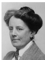
Dame Ethel Smyth

What of Mahler's female contemporaries, mostly unheralded in their time?