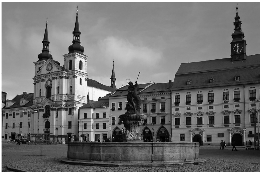
The town square of Igau (now Jihlava).