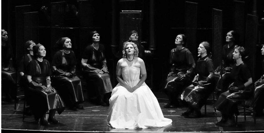
A production of Lady Macbeth of Mtsensk at the Teatro Comunale di Bologna in December 2014.