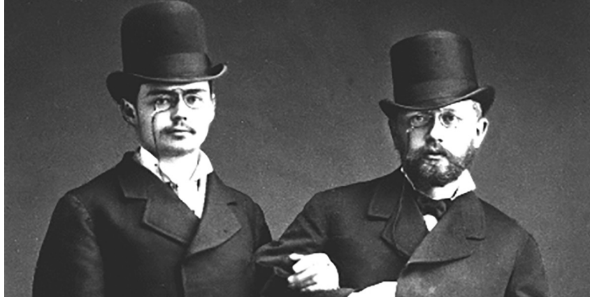
Iosif Kotek with Tchaikovsky in 1877.