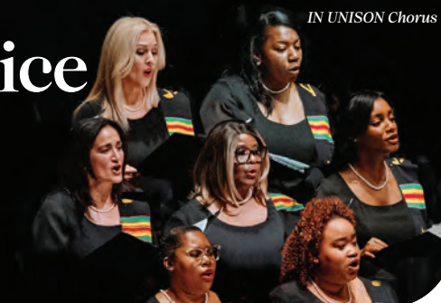
IN UNISON Chorus