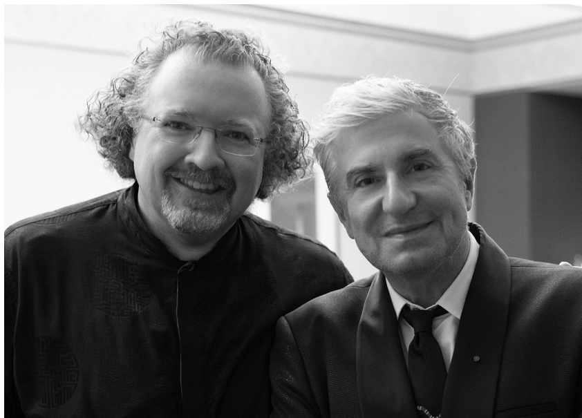
Stéphane Denève and Jean-Yves Thibaudet at Powell Hall in September.

Prejudice, Extremely Loud & Incredibly Close , and Wakefield . His concert wardrobe is designed by Dame Vivienne Westwood. In 2010 the Hollywood Bowl honored Thibaudet for his musical achievements by inducting him into its Hall of Fame. Previously a Chevalier of the Ordre des Arts et des Lettres, Thibaudet was awarded the title Officier by the French Ministry of Culture in 2012.