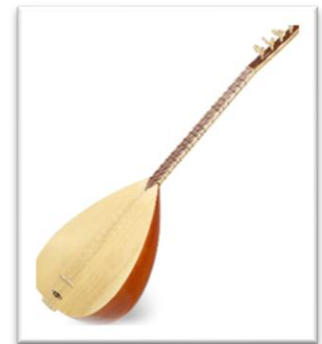
A saz is an instrument with 4 strings that originated in Turkey.

Traditionally these songs were accompanied by a Turkish stringed instrument called a saz . But Sevdah can be accompanied by many different instruments including violin, clarinet, and accordion . At the Music Without Boundaries concert, “Uzmite moj život” (“Hold my Life”) will be performed on accordion.