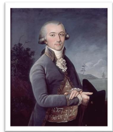
Pierre Laclède Liguest

In 1764, French fur trader Pierre Laclède Liguest, after having received a land grant from the King of France, selected the site of modern-day St. Louis to set up a fur trading post. With assistance from his 13-year-old stepson, Auguste Chouteau, he constructed a village that they named St. Louis for King Louis IX of France. Most of the early settlers in St. Louis were French, but in 1803 France sold St. Louis to the United States of America as part of the Louisiana Purchase. People from Western Europe continued to migrate to the U.S. bringing their musical traditions with them across the Atlantic Ocean. One such tradition was the orchestra. Every time we hear the St. Louis Symphony Orchestra, or any American orchestra, we are experiencing first-hand the impact Western European immigrants had on our country.