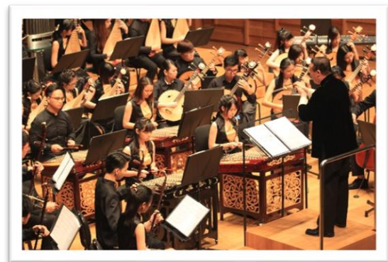
A Chinese orchestra

Watch this short video to learn more about the modern Chinese orchestra. And see and hear the erhu in this short video .