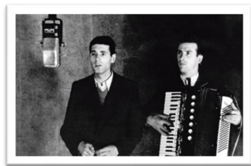
A sevdah performance with an accordion at a radio station in Sarajevo in the 1950s.

Watch this short video to learn more about the tradition of Sevdah music in Bosnia. And learn more about Bosnian culture with videos and lessons from Classic 107.3's Musical Ancestries: Bosnia .