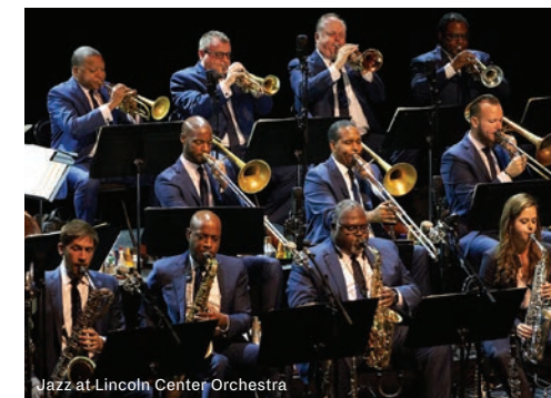
Jazz at Lincoln Center Orchestra

The SLSO does not perform at this concert.