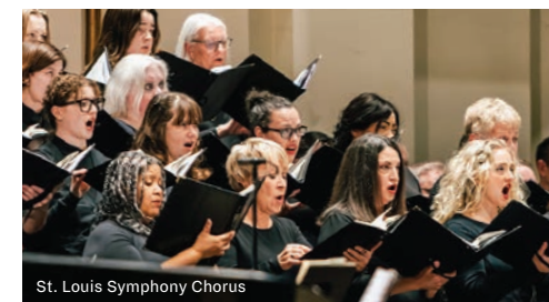
St. Louis Symphony Chorus